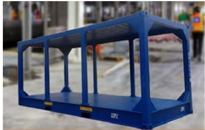
DNV 2.7-1 offshore Containers