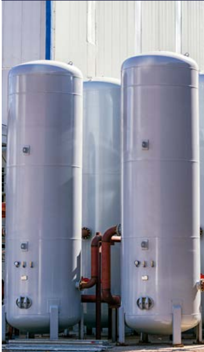
Storage tanks & Vessels