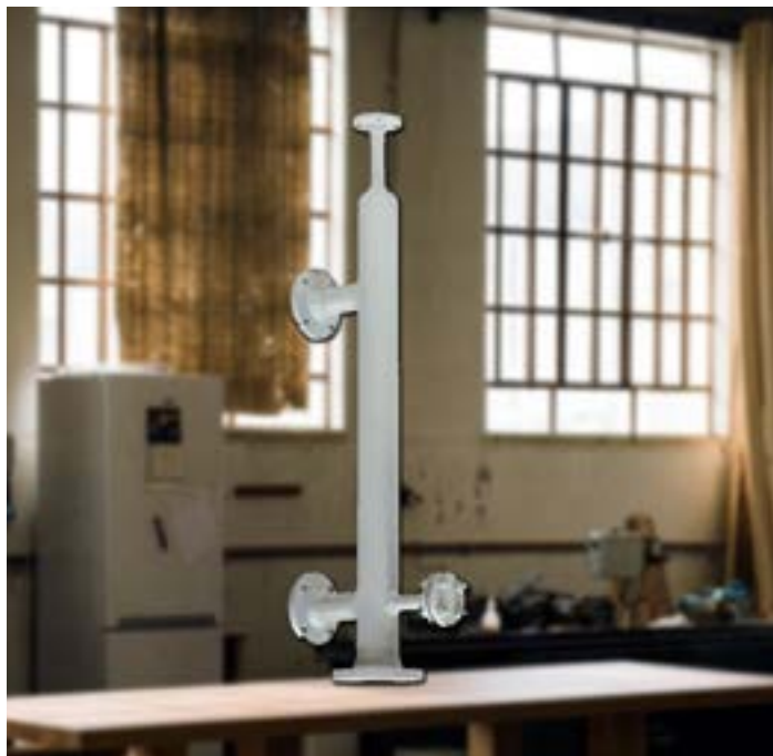
Level chambers & Volume pots