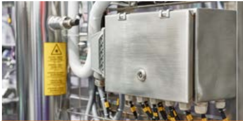
Enclosure & Cabinets