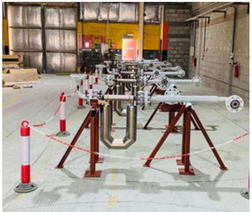
Flow Metering Skids