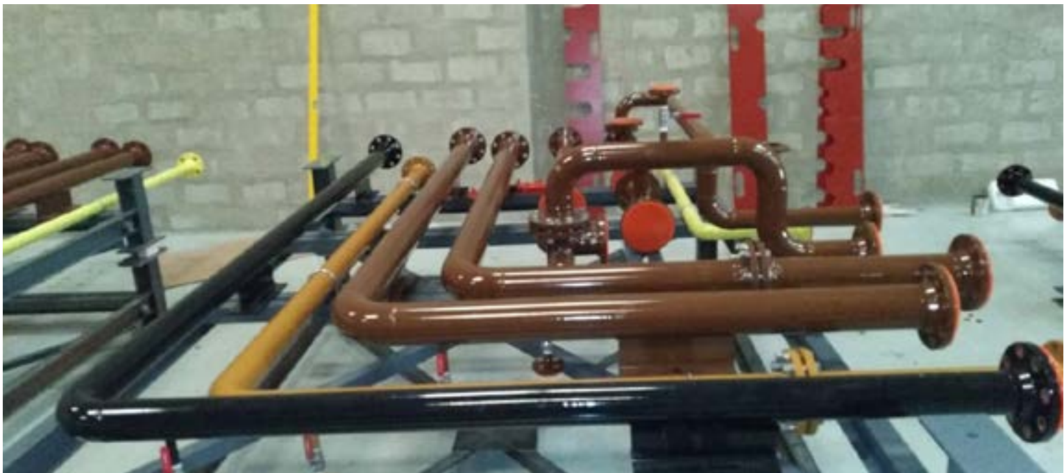
Pipings & Pipe racks